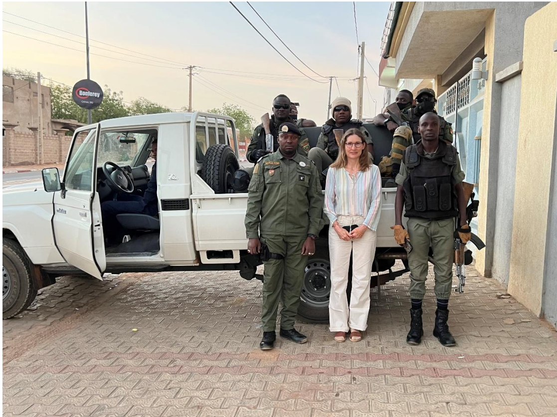
A small souvenir of my departure

At the end of my stay, getting back to the capital Niamey to catch my international flight was once again a bit of a challenge. There are almost 1,000 km to cover and for security reasons, I can't do it as freely as I used to, overland, hidden away in the back seat of a vehicle. As the humanitarian plane couldn't land in Zinder that day (there aren't humanitarian flights every day), it was decided at the last minute to drive under escort to the nearest town, where the humanitarian plane was authorised to land.