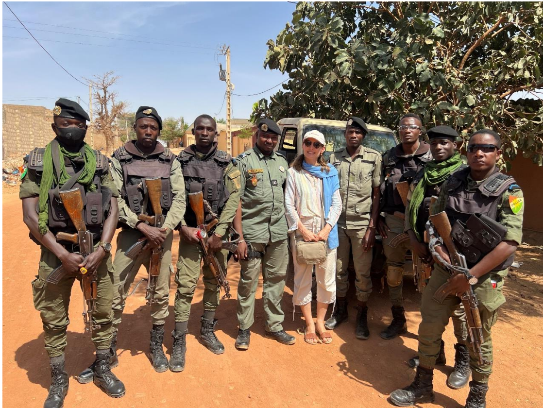
An escort is now required to travel outside Zinder

On the sound advice of His Highness the Sultan and the Governor of the Zinder region, I travelled, under police and private escort and with some of the centre's staff, to a small village in the bush where many orphaned children live.