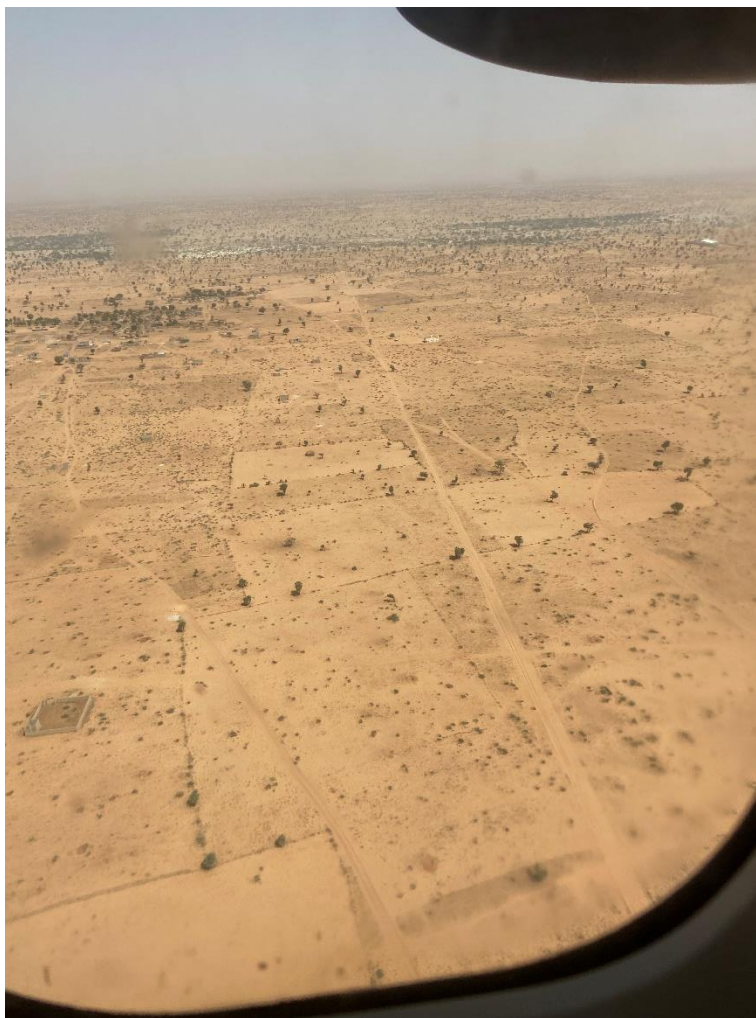
View from the plane before landing in Zinder.

That evening, a little grey mouse crept in from who knows where and scurried under my bed - perhaps to welcome me to his house? I'll be seeing his eyes and slim silhouette for the rest of my stay. I'm sure there are plenty of wings and legs under and over my bed, too! Over the past few weeks, a mouse, lizards, locusts and spiders have shared this very exotic Zindérois holiday!