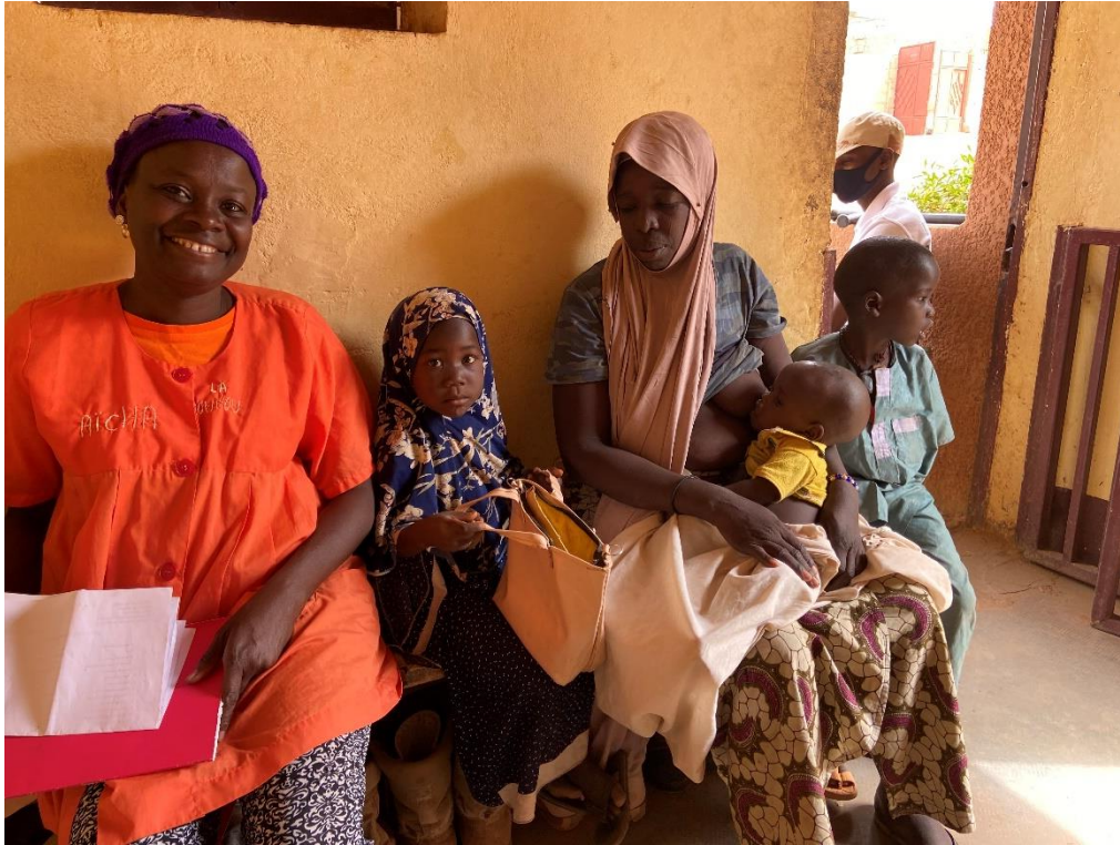
A young widowed mother with three of her five orphaned children

The number of little boarders increases with each of my visits, during which time I take the opportunity to welcome any new orphans and albino children that turn up at the centre's gates, often in a sorry state of malnutrition and hygiene.