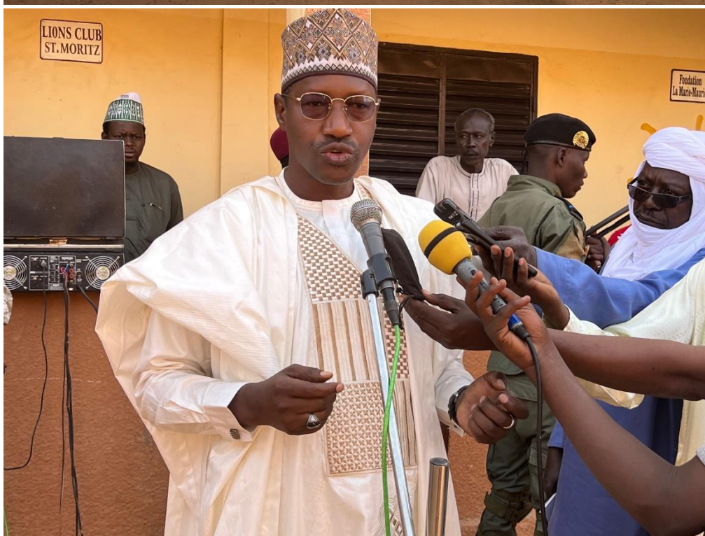
With the honourable participation of the Governor of the Province of Zinder (4.5 million inhabitants)