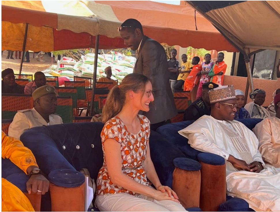
The food distribution took place under a scorching 43° - March 2023