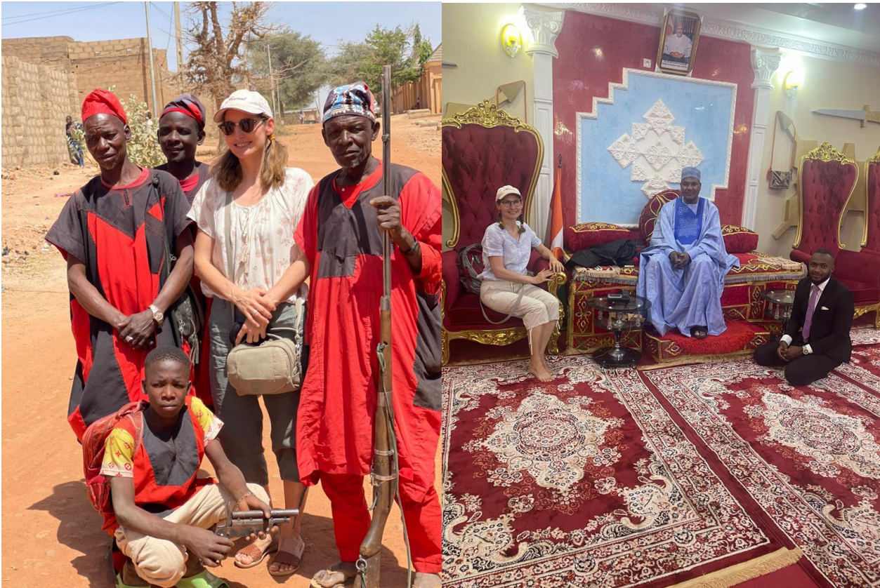
With the Sultan of Damagaram's hunters